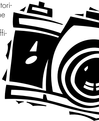
PHOTO SHOOT DAY

Articles or other information published in Foto Fan Fare may be copied for camera club use, provided proper credit is given.