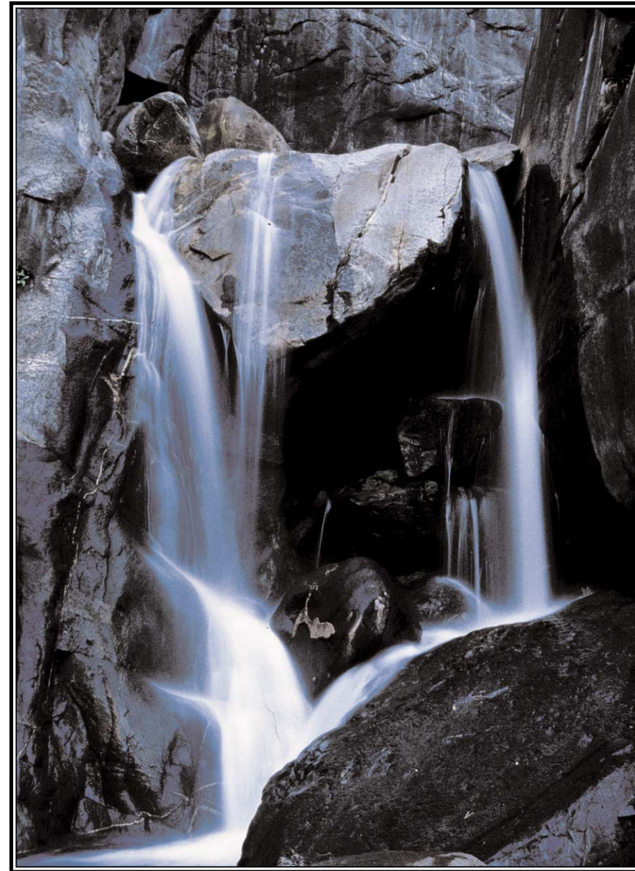
Bridal Veil - Lower Falls by Scott Golden, Livermore Valley Camera Club First Place Masters Pictorial Slides

The Redwood Coast Photo Institute offers a three week intensive outdoor photography school designed to bring the participant from the basics of photography to an enhanced level of personal expression: June 17 - July 6 • Vacation accommodations and gourmet food included • Five full-time instructors • Daily field work, classes and critiques, • Maximum 25 persons • With Gary Braasch, author of Patterns in Nature • www.RedwoodCoastPhoto.com • (707) 465-2335.