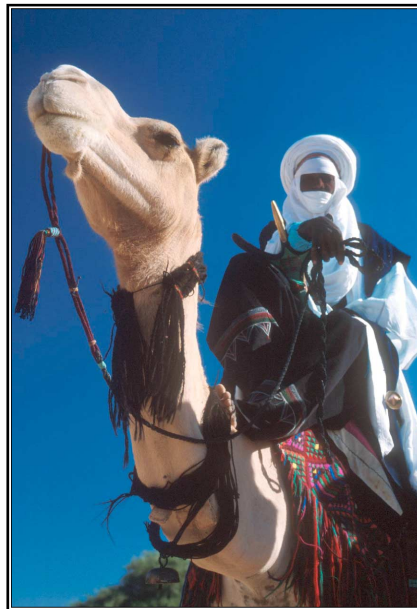
"Sahara Warrior" by Paul Hassnick, Marin Photography Club First, Class B Travel Slides

Watch for the new Foveon X3 technology sporting a new type of sensor that can apparently capture digital images virtually grain-free, exceeding even slide film! Sigma's D-SLR for $3000 is first entry in the field.