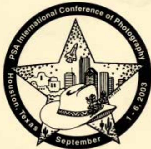
PSA International Conference of Photography September 1 - 6, 2003 Adams Mark Hotel Houston

Just dig out your April issue of the PSA Journal for the registration form, ask your N4C representative for a copy or log on to the PSA site: