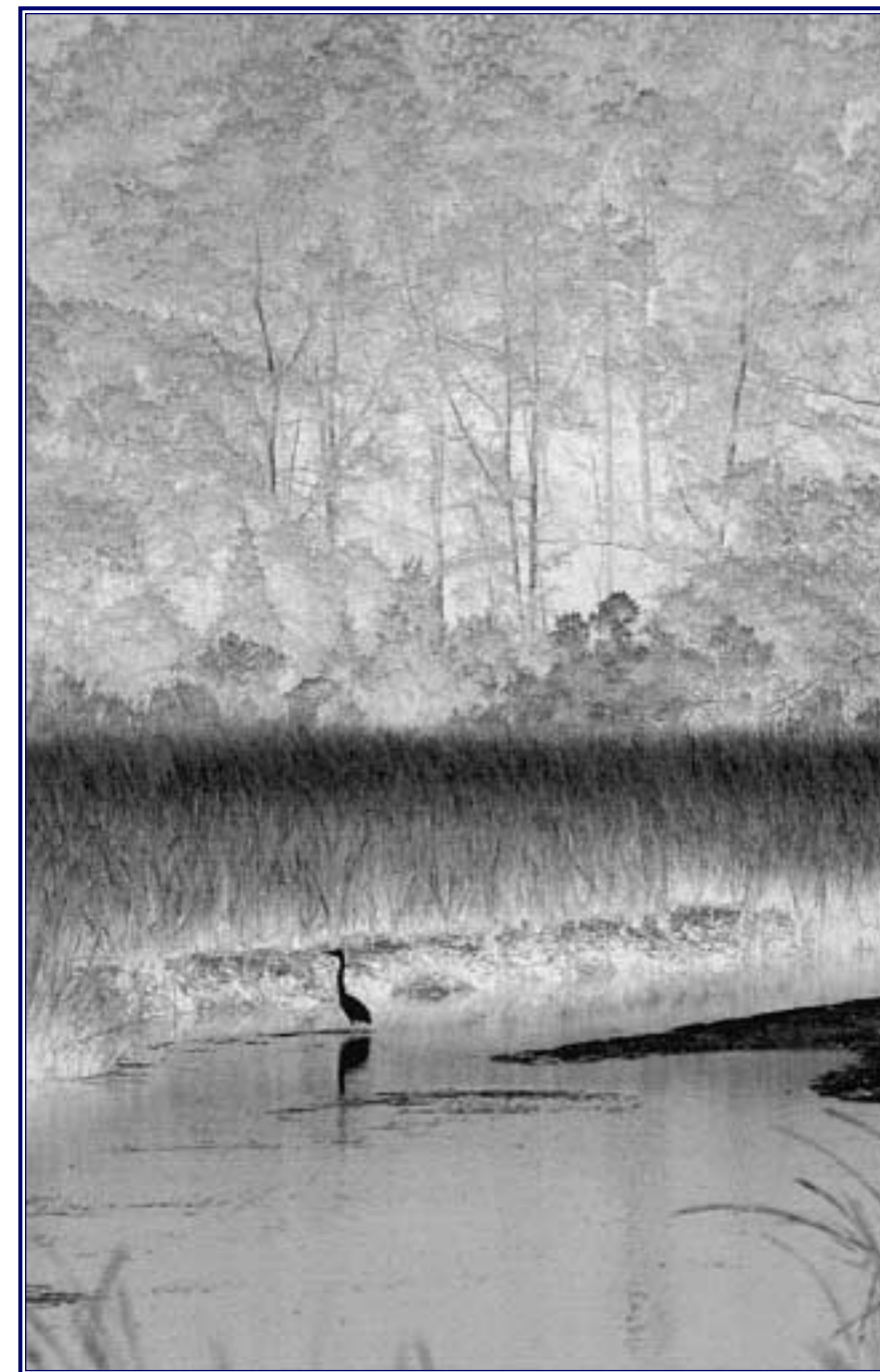
"Egret at Pawley's Island" by Rosario Sapienza of Marin Photography Club Winner, B & W Amateur Prints

PHOTOSHOP TIP: CONTROLLED SHARPENING WITH THE PAINT BRUSH: Copy your original image and work only on the copy. Use Unsharp Mask set at e.g. Amount: 200; Radius 1.4; Threshold 4. This will oversharp. Make a full mask set to "Hide All" on the copied image. Highlight the mask; use the Brush Tool set at an opacity of about 20% (use white), choose your brush size and brush in only the areas you want sharpened. It will be a softer and more exact sharpening. Obviously, you can change the opacity of the brush for different effects.