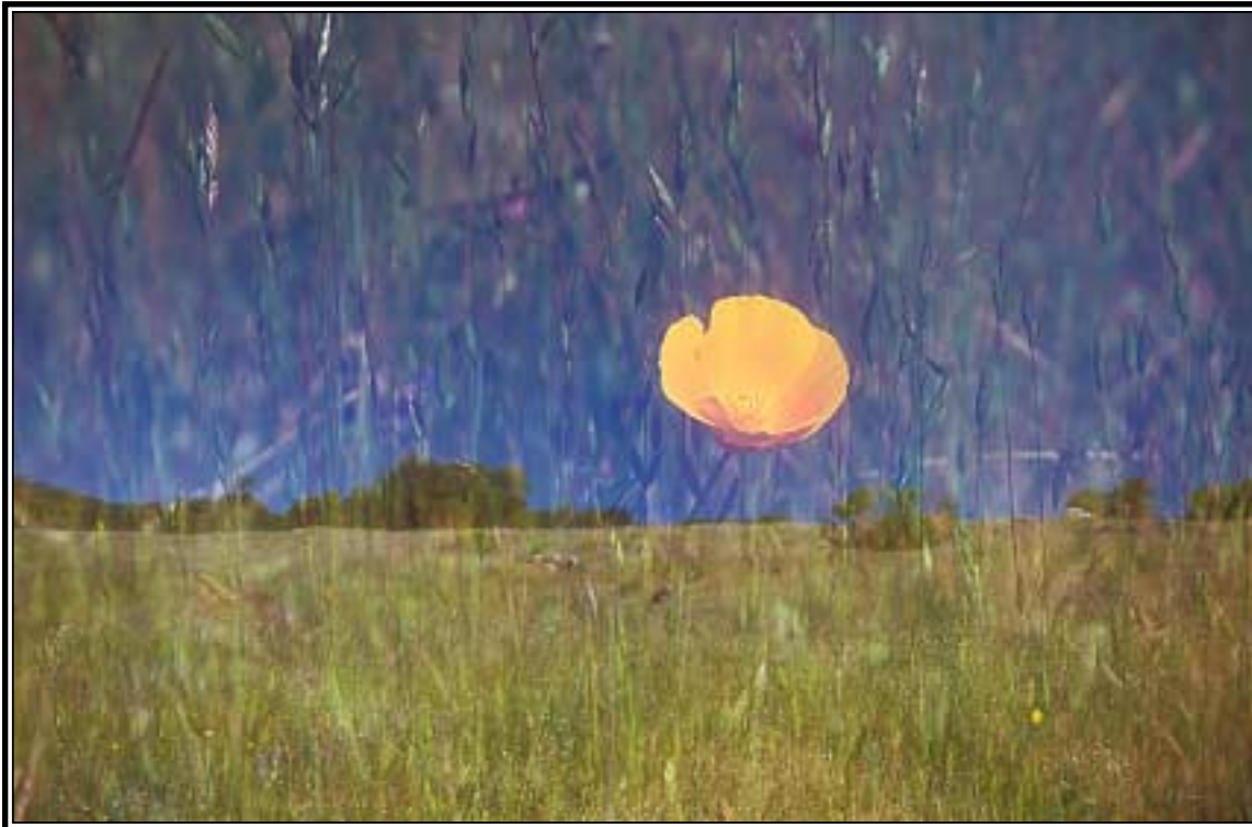
“Solar Poppy” by Jim M. Goldstein of Photochrome Club Winner, Creative Slides, Class B

(10) If you absolutely must have a tripod but didn't bring one (especially for night shots), try to construct a substitute. Try tying the top of three poles with a belt or any other handy rope, leaving about six inches above the tie. Wedge the camera into the top of the poles. The bottom of the poles, of course, are shaped into a tripod-like array.