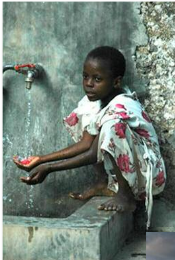
Above: "Cooling Off at Zanzibar, Africa" by Beth Wensley of Peninsula CC; Winner: Travel A Pls