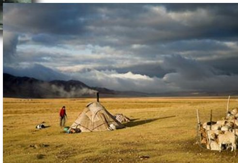
Right: "The Nomadic Homestead of Hasaka People" by San Yuan of Contra Costa CC; Winner: Travel AA Pls