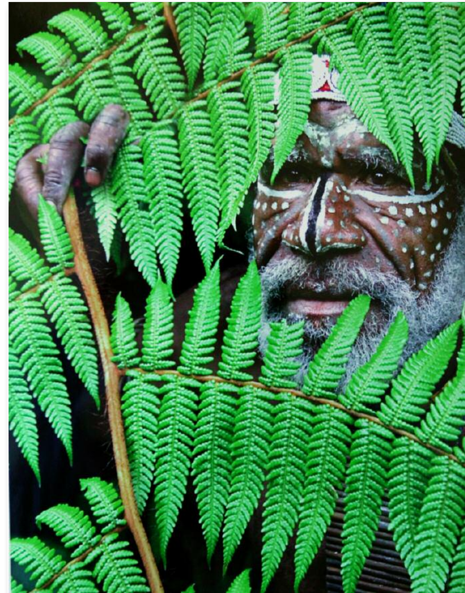
"Big Chief Lurking in the Bushes, Papua, New Guinea" by Bilha Sperling of Contra Costa Camera Club: Winner: Travel Projected Images AA