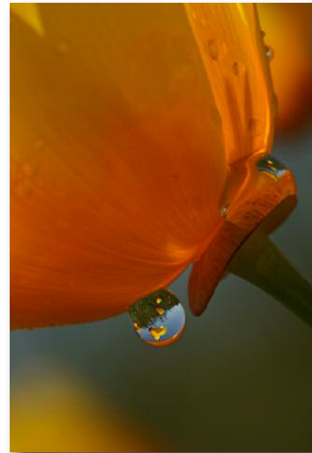
"Poppy Dew2u" by Stacy Boorn of Photochrome Club Winner: Pictorial Masters

The 2007 PSA Exhibition's entry forms and "information and instructions" (and general rules) are available at www.psaexhibition.com