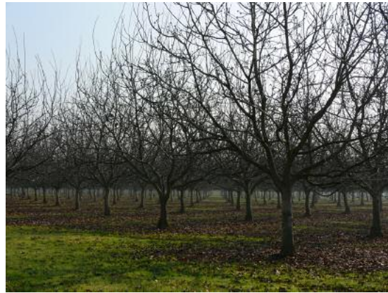
Original Orchard - BORRRING!

Here's an example that uses both Inversion and cropping to come up with something that has extended interest and punch.