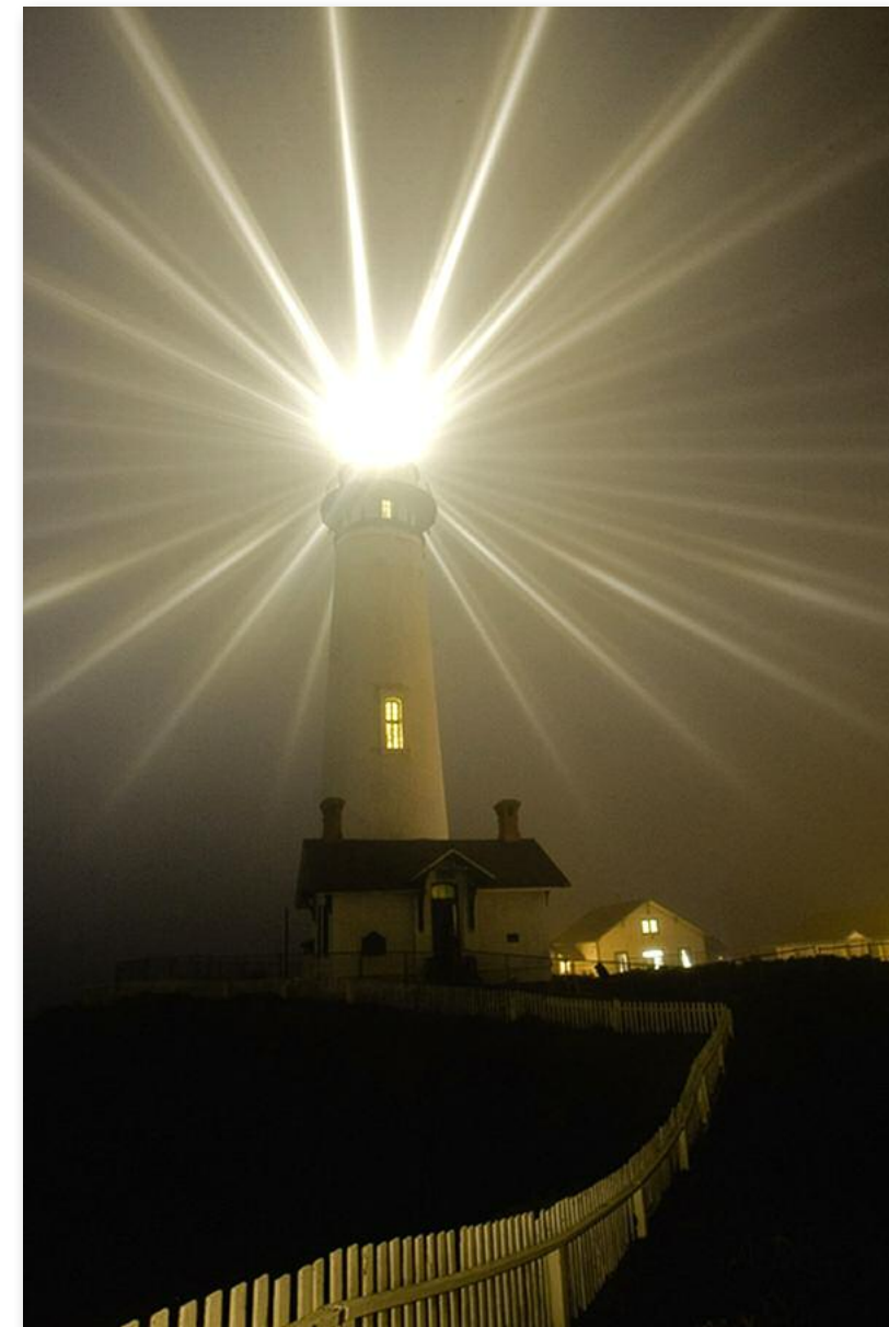
"135th Lighting of the Pigeon Point Lighthouse" by Bruce Finocchio of Peninsula Camera Club; Winner