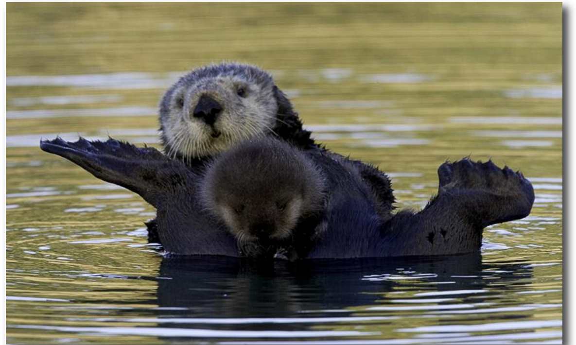
"Very Young Otter between Mother's Back Legs- Typical of Feeding and Resting"; Winner: Nature M Pls