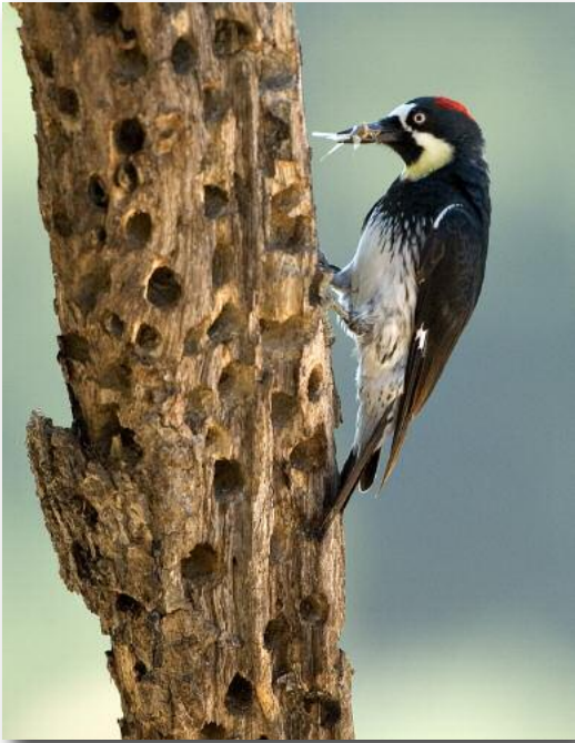
1 of 2: "Female Acorn Woodpecker Placing Insect into Granary Hole" by Greg Wilson of Berkeley CC Winner: Nature A Pl