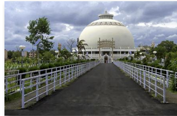
"Buddha's Temple, Nagpur, India" by Ashish Tarhalkar of Livermore V. CC; Winner: Travel Projected Images Basic