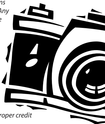
Foto Fanfare is the official publication of N4C, the Northern California Council of Camera Clubs, a federation of 11 Camera Clubs located in the greater Bay Area. Its goals are to hold monthly competitions among member clubs and present special informative programs whenever possible. Any articles, letters to the editor or editorial comments are the opinions of the authors, and not official N4C policy. Articles or other information published in Foto Fanfare may be copied for camera club use, provided proper credit is given.