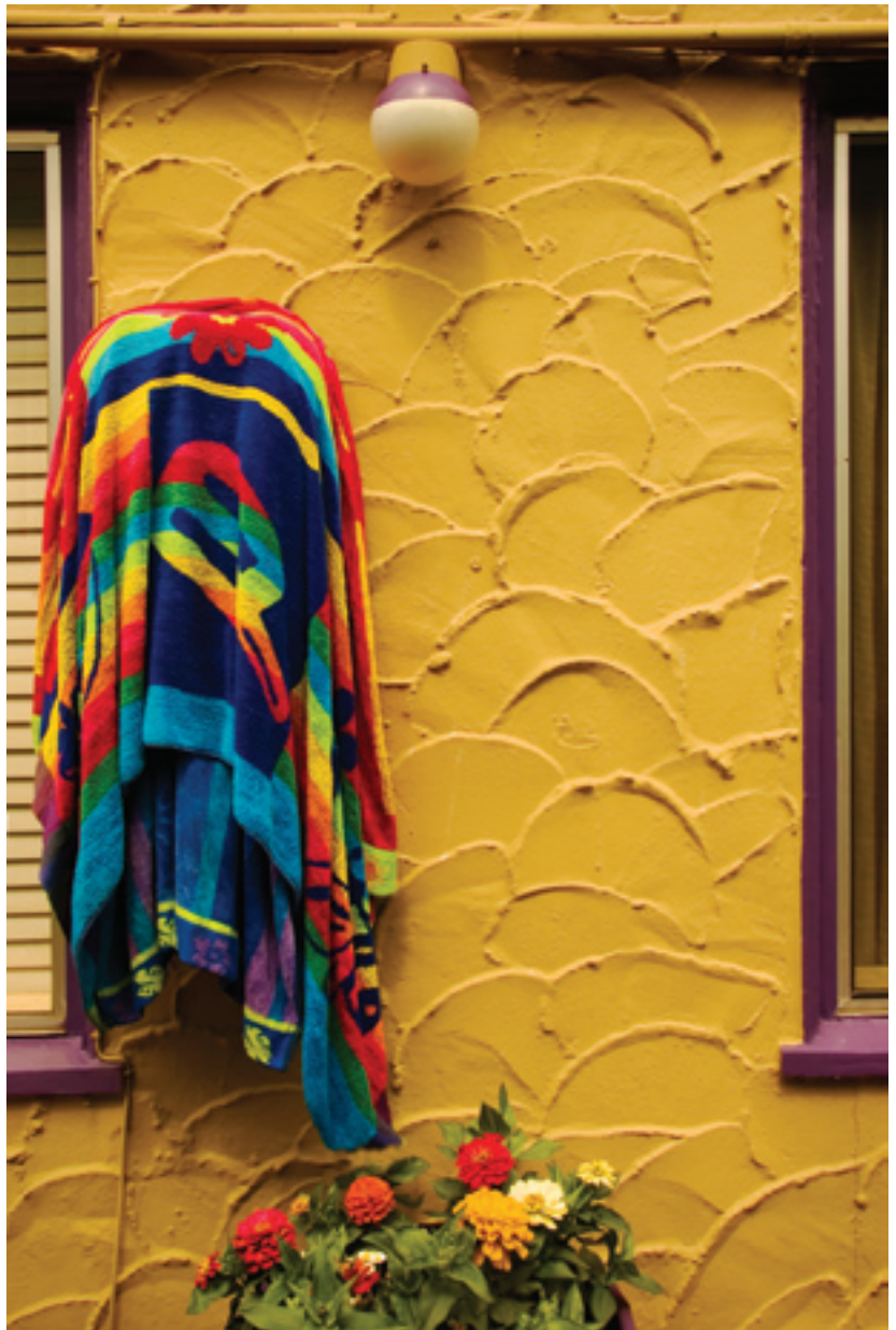
Towel in Capitola, CA