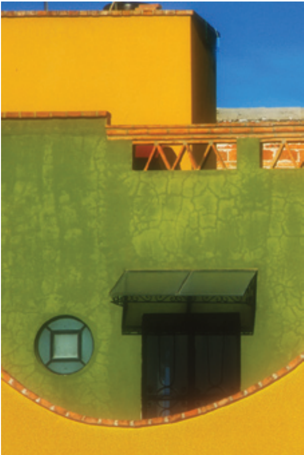
San Miguel building