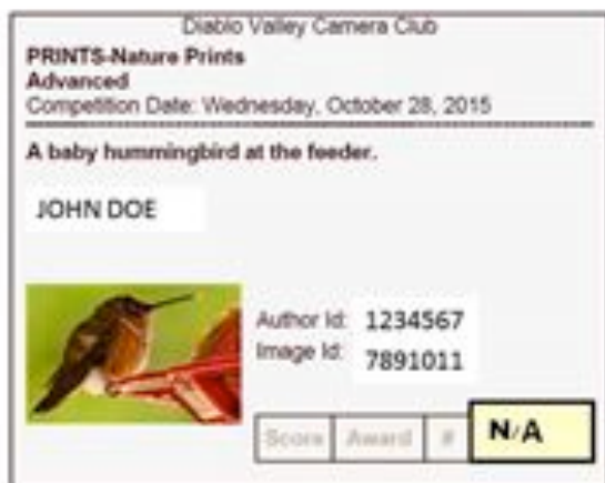
Example of a correct club label