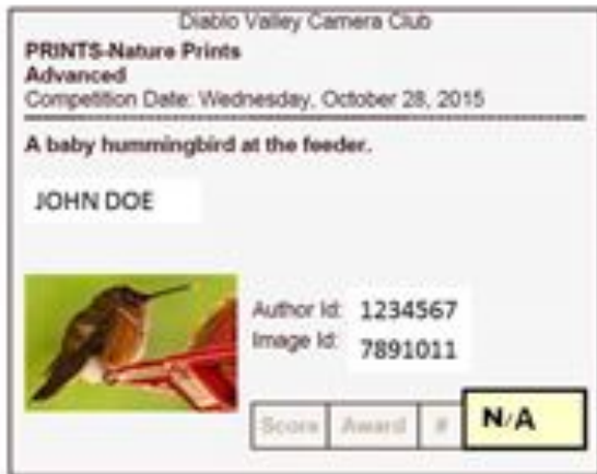
Example of a printed club label from Visual Pursuits