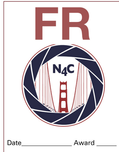
Sample N4C Interclub Competition Label