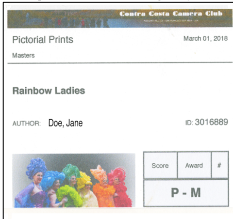
Sample Club Print Label designed by club