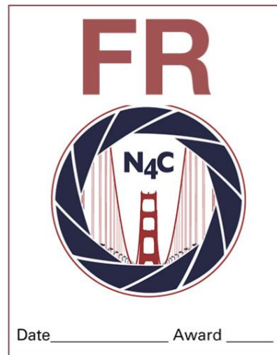
Figure 3. N4C Interclub Competition Label (from N4C web site)