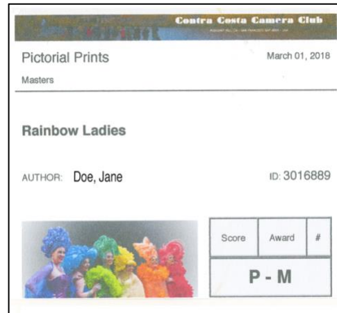
Valid example designed by club