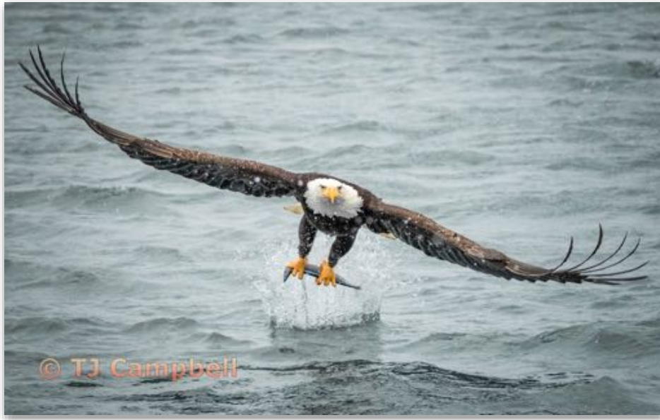
Nature Prints - 1st Advanced

Bald eagles have powerful hooked beaks to tear flesh from their prey, strong legs, and powerful talons. They have extremely keen eyesight to spot potential prey from a long distance. Homer, Alaska