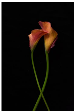
A Quiet Pair

You can use almost anything you want as a background, but you don't want it competing with your arrangement. {" Ranunculus "} {" Looking towards fall "}