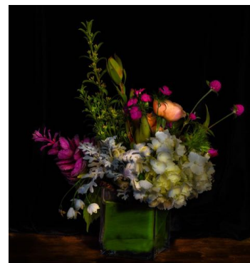
Flower Arrangement on Black

You are also not limited to living things. Rocks, objects you can put together as a still life are all possibilities. {" Flower arrangement on black "}. Just as in a landscape image, you want to consider what is the story you want to tell, and what will a viewer feel when they look at your finished composition. ( Hint- if you can't make your arrangement on the floor, do it at a comfortable height on a stable surface, like a dining table or coffee table, and then carefully lower it to the floor, so that you will have adequate distance from your arrangement for photographing. {" Building for Peace "}