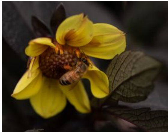
Honeybee at Work