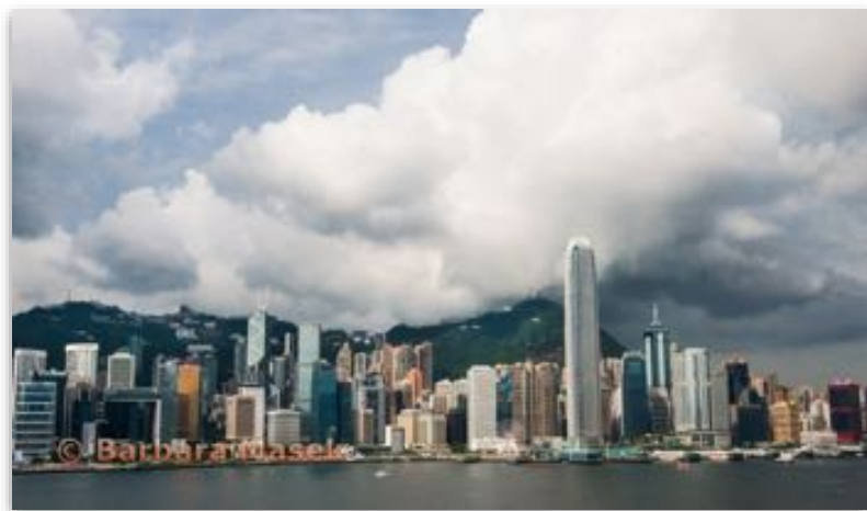
Travel Prints - 3rd Basic