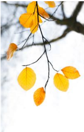
Last of the Leaves