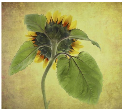
Looking Towards Fall