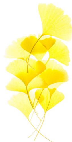
Building for Peace

You are also not limited to living things. Rocks, objects you can put together as a still life are all possibilities. {" Flower arrangement on black "}. Just as in a landscape image, you want to consider what is the story you want to tell, and what will a viewer feel when they look at your finished composition. ( Hint- if you can't make your arrangement on the floor, do it at a comfortable height on a stable surface, like a dining table or coffee table, and then carefully lower it to the floor, so that you will have adequate distance from your arrangement for photographing. {" Building for Peace "}