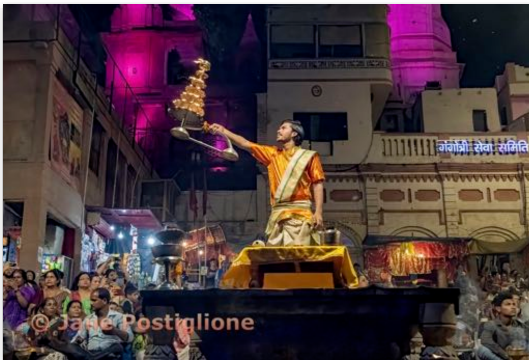
Travel Prints - 1st Advanced

Hindu Pandit raises oil lamp in prayer at the Aarti Ceremony Honoring Goddess Ganga, the personification of the Holy River Ganges, Dasaswamedh Ghat, Varanasi, India