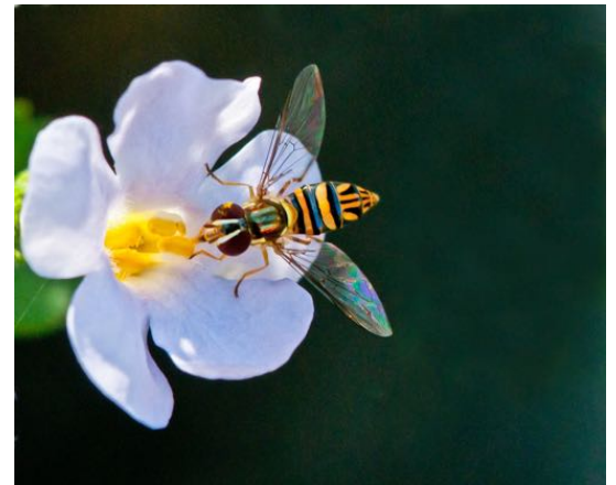
Hoverfly gathering pollen