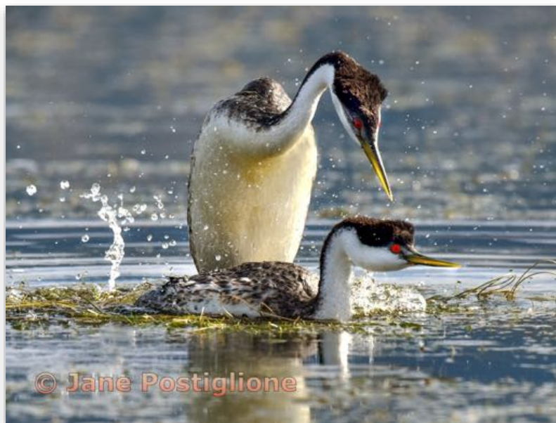
Nature Prints - 3rd Advanced