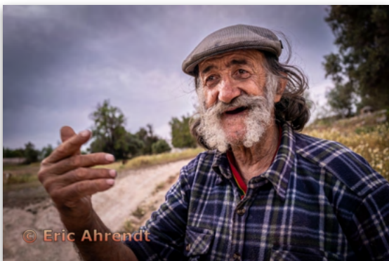
Color Prints - 3rd Masters