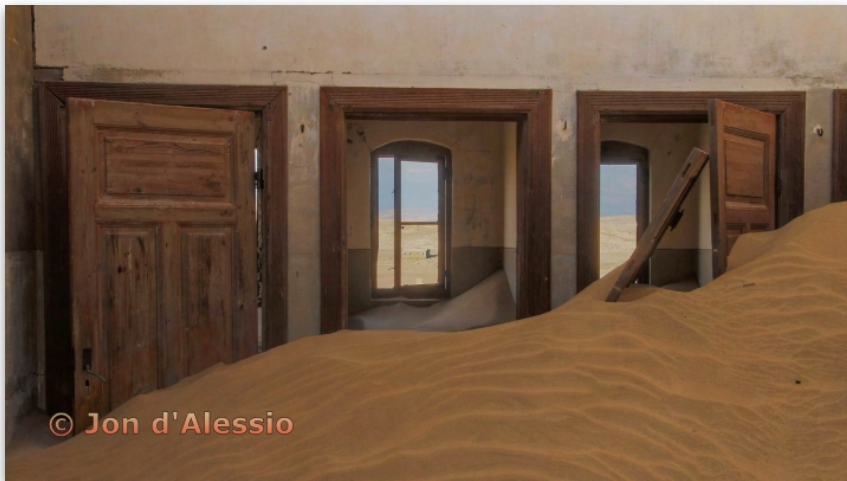
Abandoned Prints - 1st Advanced