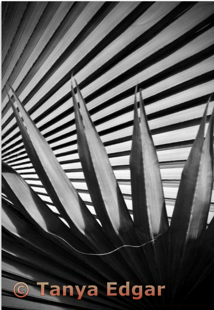
Creative Projected - 1st Basic