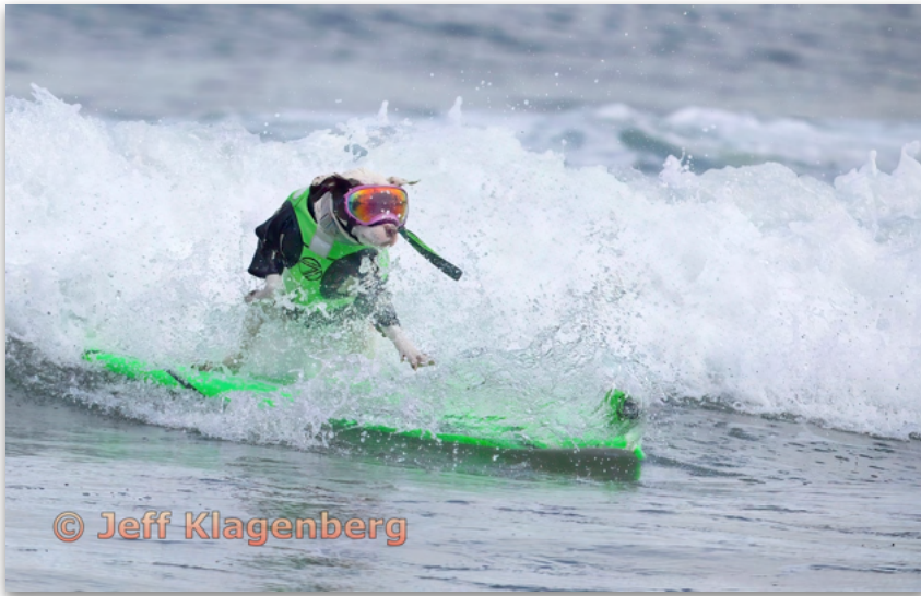
Journalism Prints - 3rd Advanced