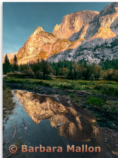
Color Prints - 4th Masters