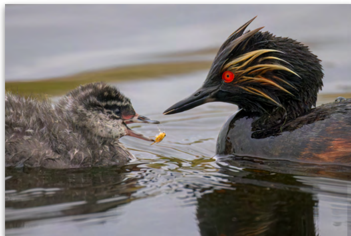
Eared Grebe Chick Catches Aquatic Insect Larva by Bruce Finocchio — 2nd Place