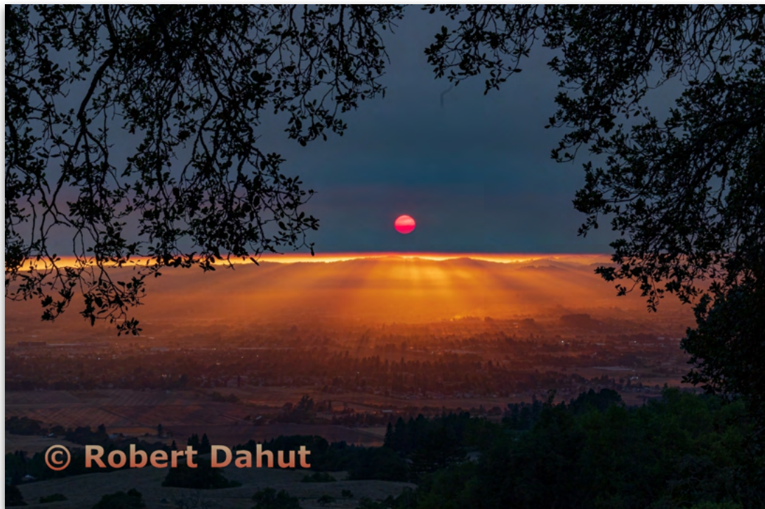
Pictorial Projected - 1st Basic

Sun casting light through the Smokey air of the Walbridge Sonoma County wildland fire 2020.