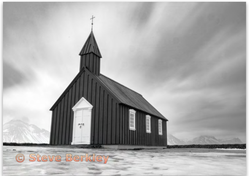
Monochrome Prints - 3rd Intermediate