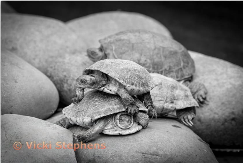
Monochrome Prints - 1st Intermediate