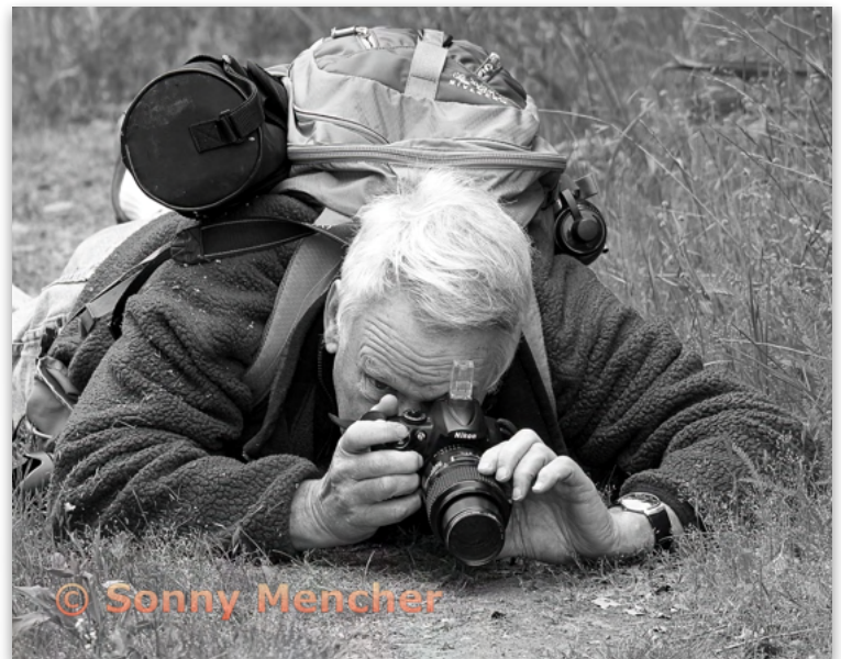
Journalism Prints - 5th Advanced

A Docent at Jasper Ridge Biological Preserve, Portola Valley, CA, photographs an ant colony . Photo helps with accurate documentation of activities, species- especially if mixed species. Sonny Mencher Peninsula Camera Club