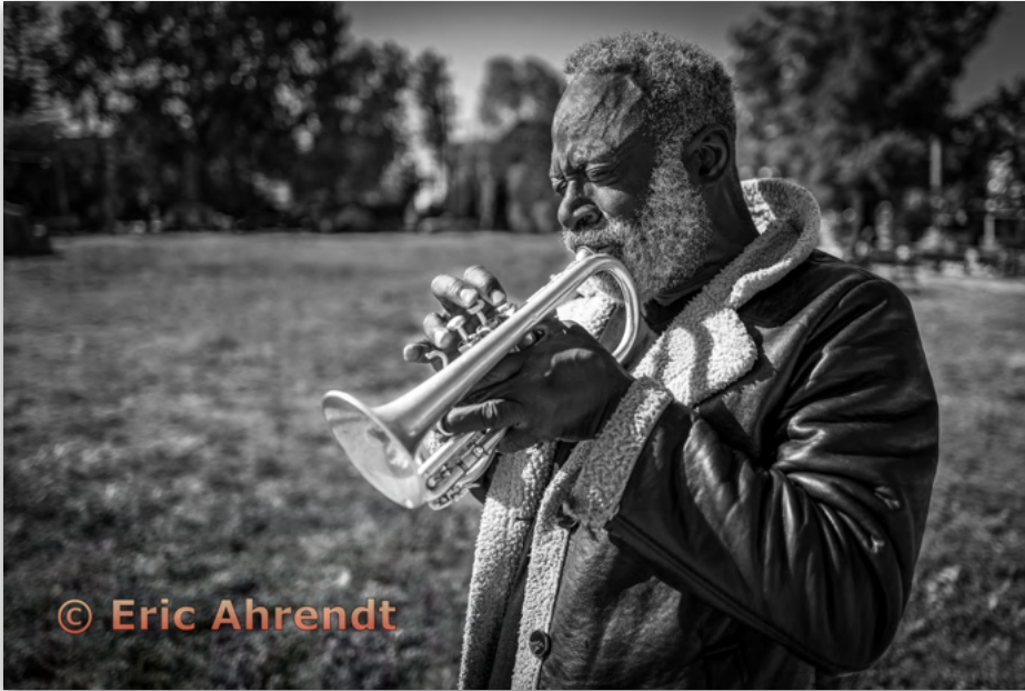
Monochrome Prints - 1st Masters