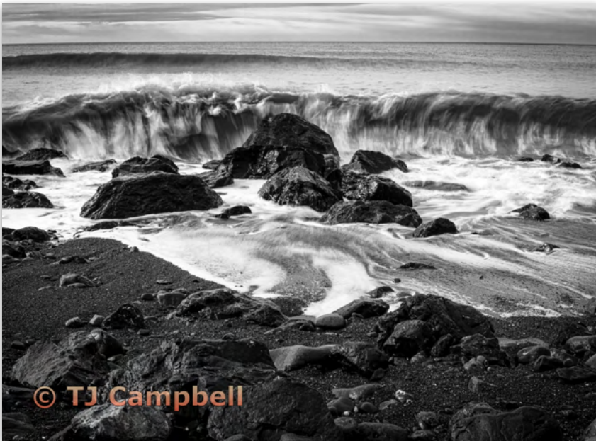
Monochrome Prints - 3rd Masters

The Wave Curl TJ Campbell Marin Photo Club