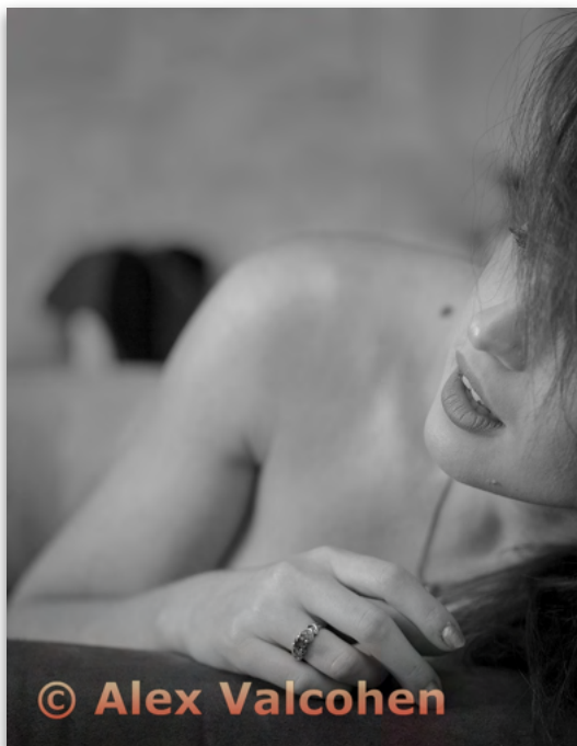
Monochrome Prints - 5th Masters