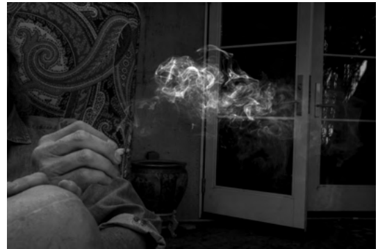
Figure 2. Los Angeles, California 2019. M.H. Rubin.

immortalize a unique moment in time. (figure 2) The photograph is an authentic representation of that moment, including its imperfections. In fact, it may be defined by those imperfections (figure 3). In a great photograph everything arranges itself within the frame just so , what Cartier Bresson called “the decisive moment”. A great photographer recognizes those moments and knows how to capture them. Post processing may use dodging and burning to direct our attention (figure 4), but little else.