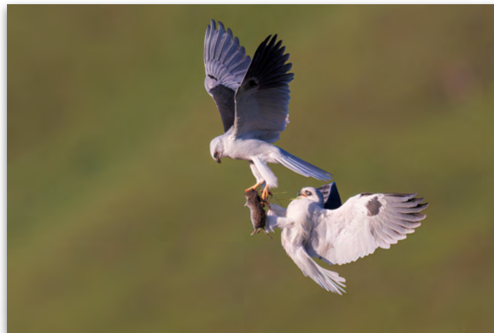
Male White-tiled Kite Exchanges a Capture CA Vole... by Bruce Finocchio - 1st Place