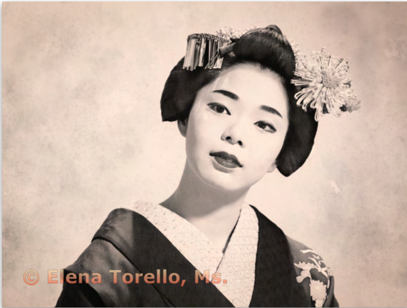
Monochrome Prints - 1st Basic