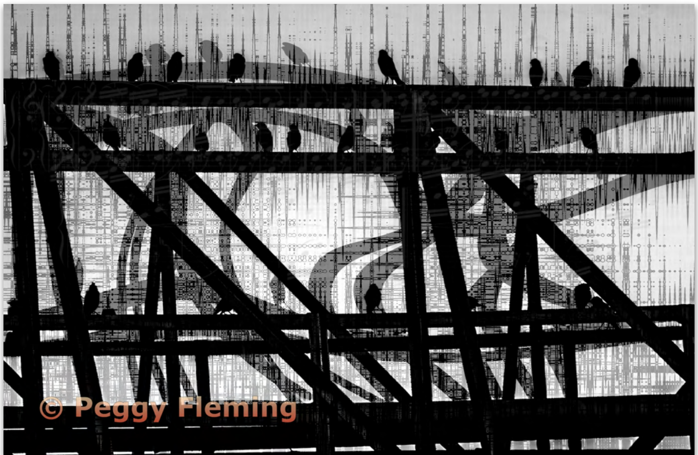
Creative Projected - 1st Advanced

On the Rails Peggy Fleming Contra Costa Camera Club