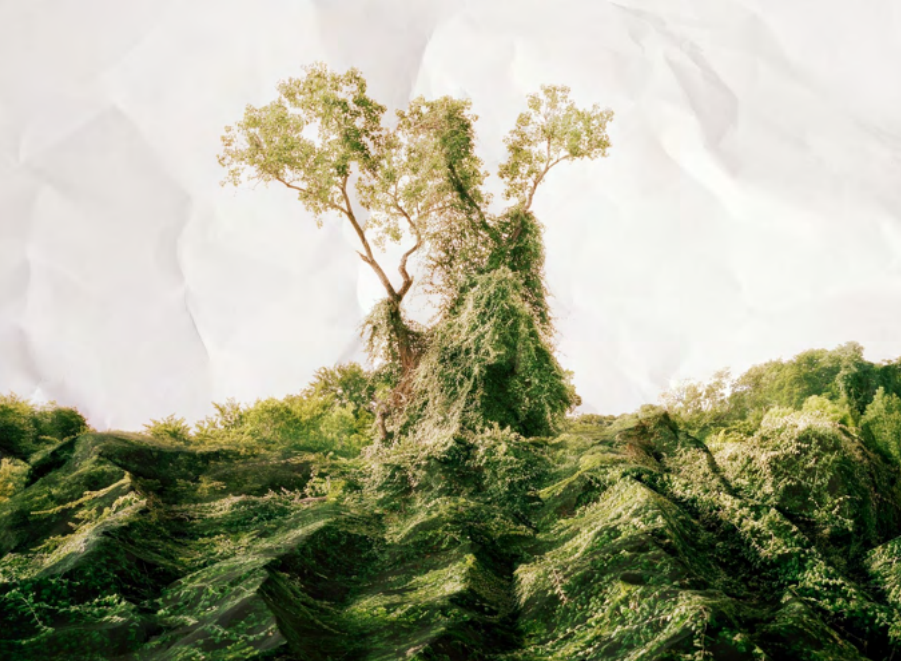
Figure 6. Response to a Photograph of Kudzu, Texas, 2010 . Laura Plageman. The photograph was manipulated to look like waves, representation how kudzu has "washed over" the native environment. Plageman produces "works that oscillate between image and object, photography and sculpture, landscape and still life. While they may appear illusory, the resulting pictures are documents of actual events and are thus as authentic as the original representational images contained within".

As Generative Artificial Intelligence becomes ever more prominent, some people suggest we need a new division that allows AI. But as AI gets ever more integrated into our tools, perhaps what we really need is a new "Authentic Photography" division.