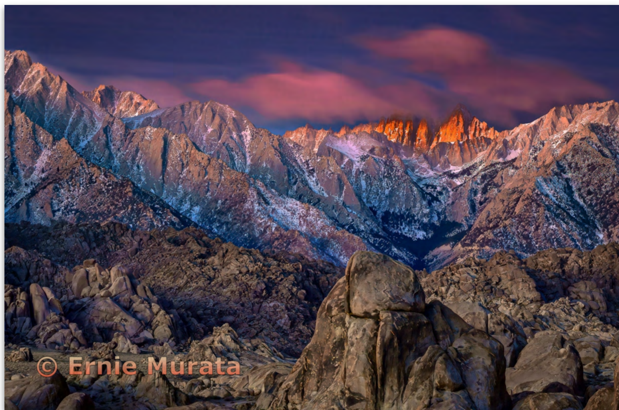
Pictorial Projected - 1st Masters

Mt Whitney peaking through the clouds at sunrise.