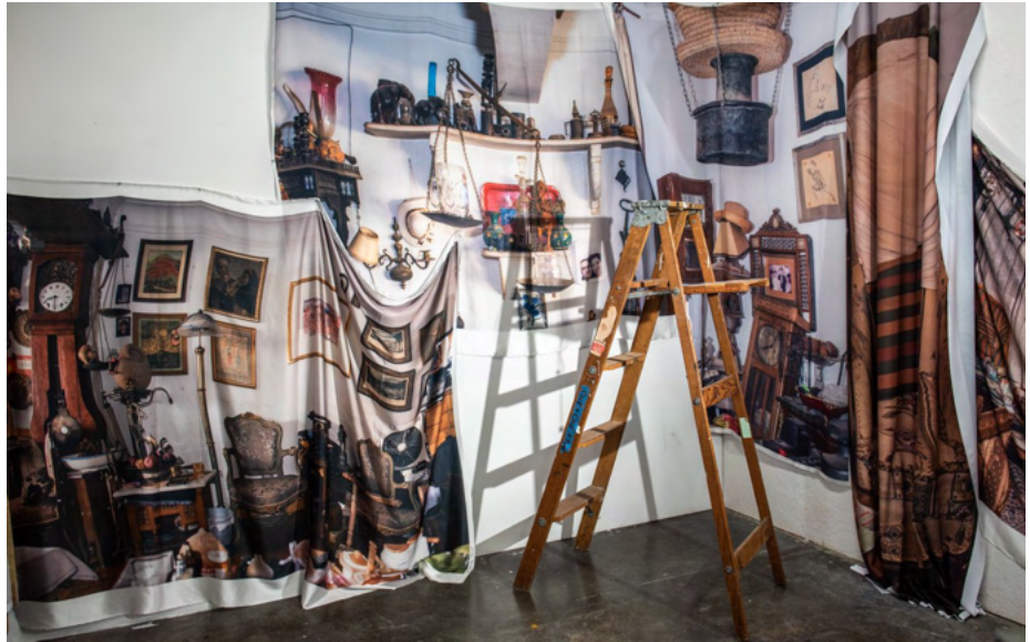
Figure 5. Ebti. From the series We didn't part but we will never meet again .

Back when N4C had a Color Slide division, it is probably safe to assume that many of the best entries resulted from a philosophy similar to Rubin's. Even entries in the print divisions had limited manipulation. For people who wanted a different type of creative freedom, new Divisions were formed. The names and the styles they represented changed over time: "Open" 1961-1973, "Contemporary color slides" 1988-1999, "Manipulated Prints" 1989 - 1991, "Contemporary Prints" 1992-1999 and "Creative" starting in 2000.