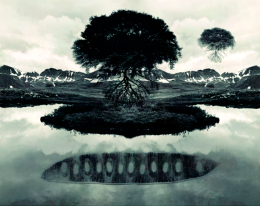
Figure 1. Untitled, 1969 (Floating Tree). Jerry Uelsmann. Silver gelatin print created by blending various negatives while printing in the darkroom

FotoClave 2024 has passed into history. Now, with some distance from the event, what strikes me is how the various speakers presented radically different answers to the question “What is Photography?”