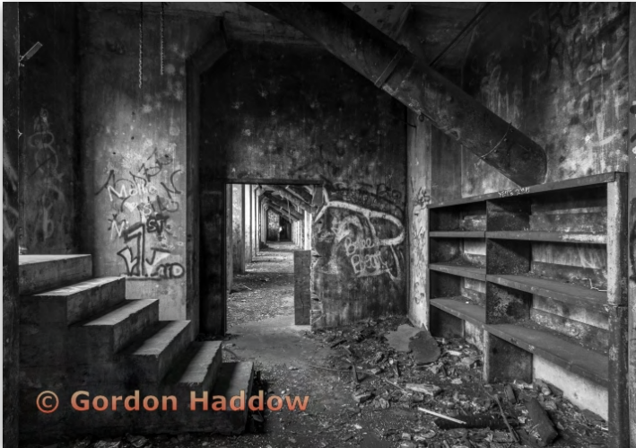
Abandoned Prints - 1st Basic