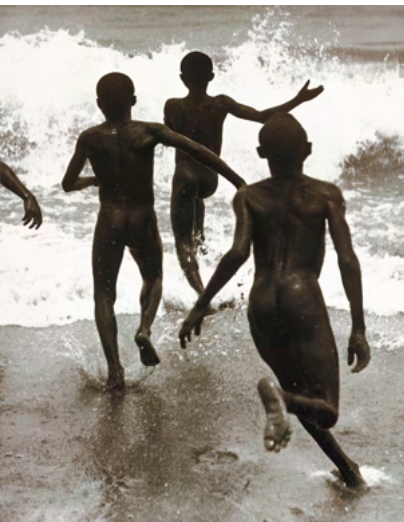
Figure 3. Liberia, circa 1930. Martin Munkácsi. Would you have cropped or cloned out the arm extending into the photo from the left border?