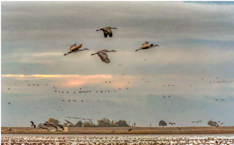
Sandhill Cranes fly out at dawn from ponds at Staten Island Preserve, Thornton, CA