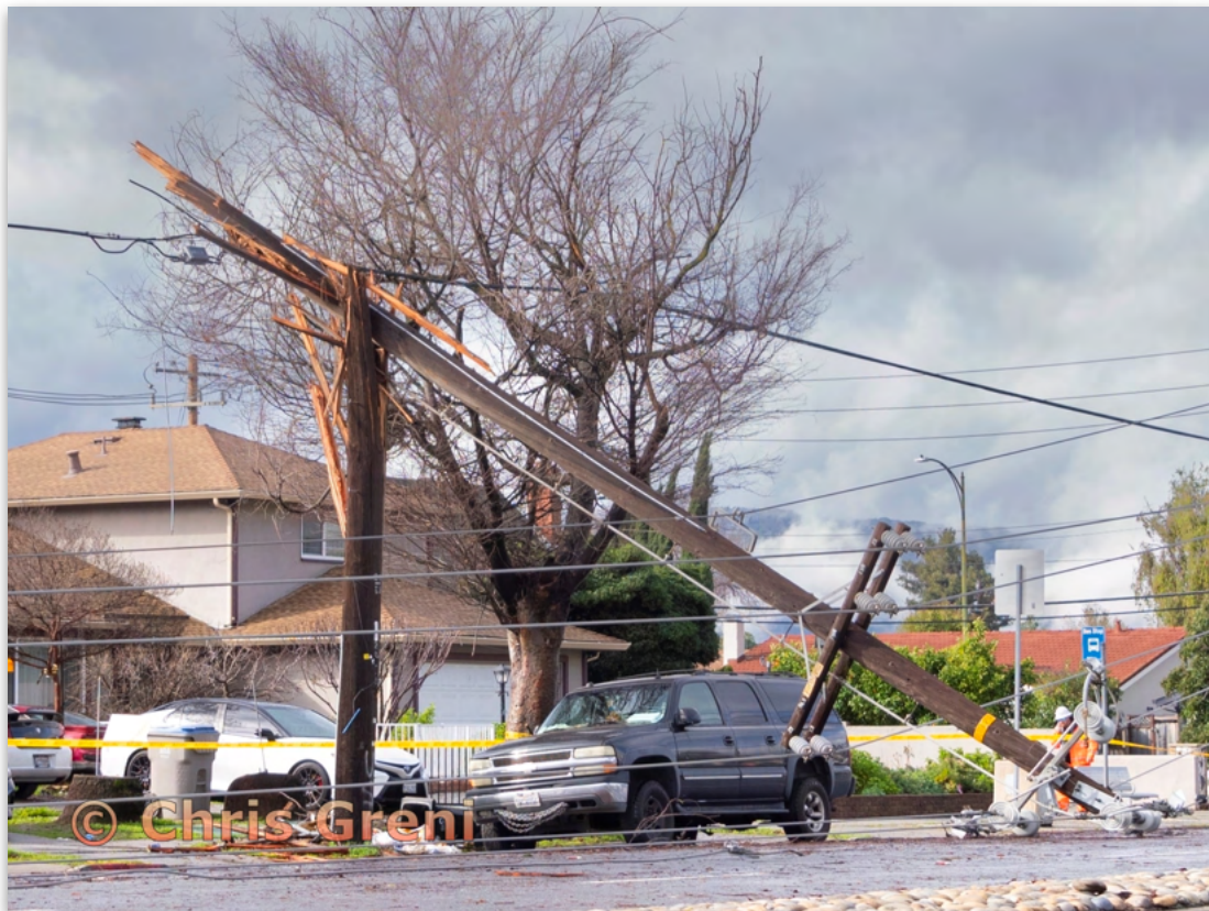
Journalism Projected - 1st Basic

Powerful winds toppled a utility pole on Blossom Hill road in San Jose, Feb 4th, 2024