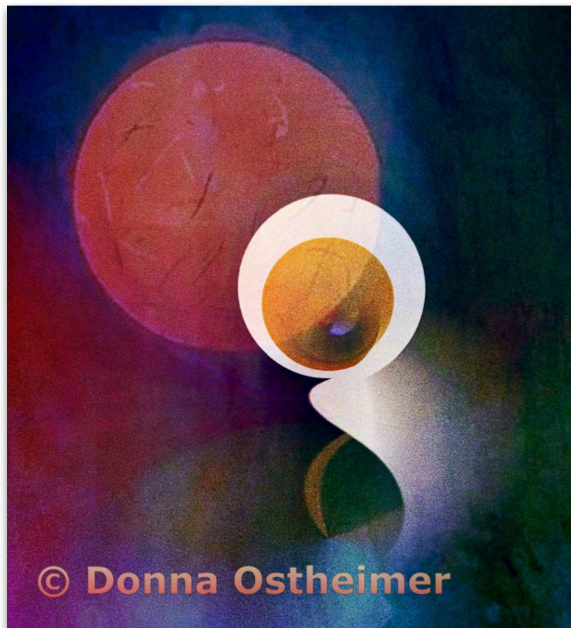
Nature Projected - 1st Masters