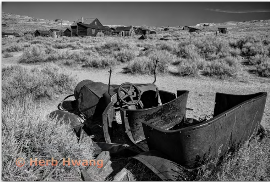
Abandoned Prints - 4th Advanced