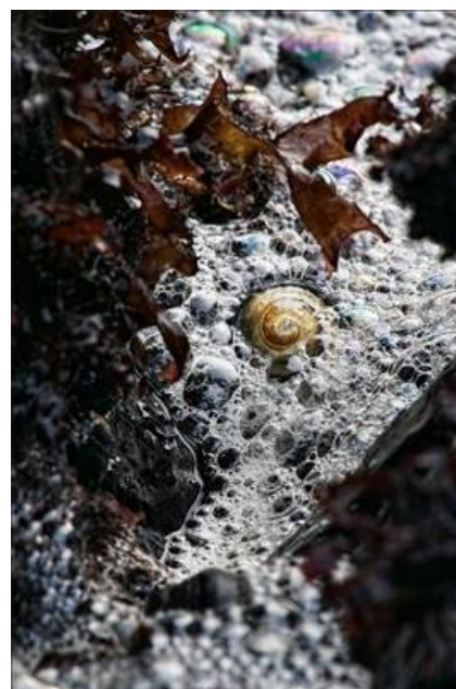
First Place, Best in Show Nature Prints - Basic Black Turban Snail (Tegula funebris) in Tidal Sea Foam Jeff Klagenberg Peninsula Camera Club

To View all the Winning Images Go to the N4C web page