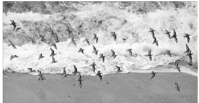
First Place Monochrome Prints - Intermediate Shore Birds in Flight Kirsten Klagenberg Peninsula Camera Club