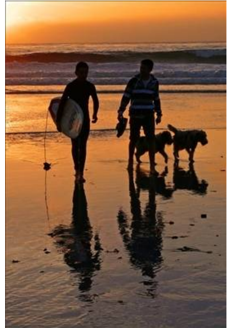
Third Place Pictorial Projected Images - Intermediate End of the day Annie Trouve Berkeley Camera Club