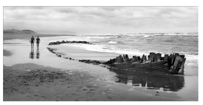
Third Place Monochrome Prints - Intermediate Ship Wreck at Ocean Beach Kirsten Klagenberg Peninsula Camera Club