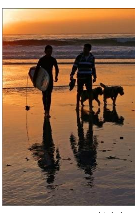
Third Place Pictorial Projected Images - Intermediate End of the day Annie Trouve Berkeley Camera Club