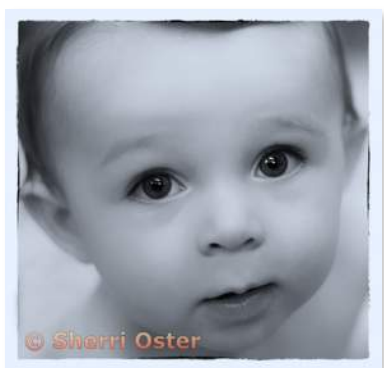
Pictorial Projected - 1st - Basic