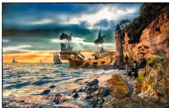
Creative Projected - 1st - Advanced