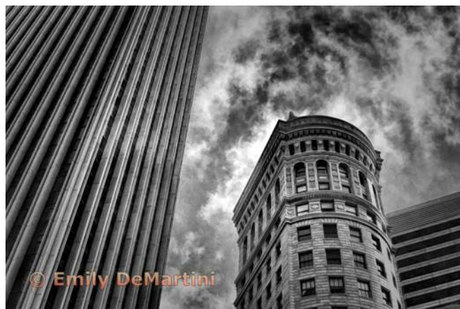
Creative Projected - 1st - Masters