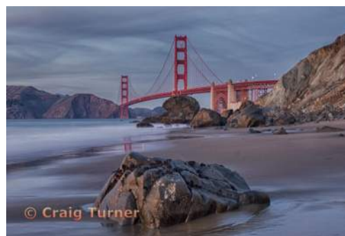
Pictorial Projected - 1st - Intermediate

The Golden Gate at sunset with a storm blowing in from the Pacific.