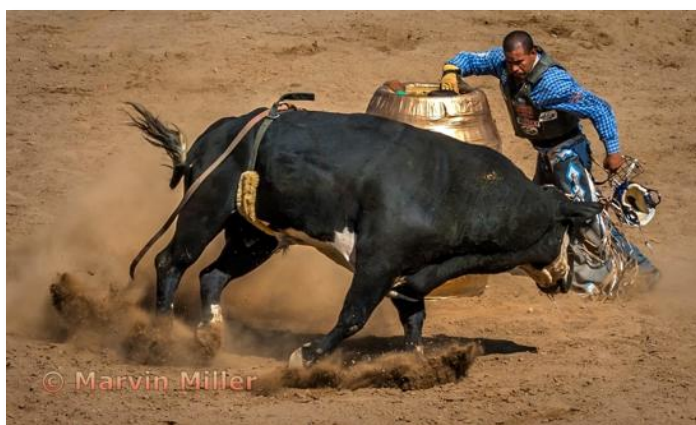
Journalism Projected - 1st - Advanced

Thrown Rider Attempts To Evade The Angry Bull