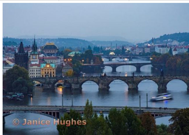
Travel Projected - 1st - Masters