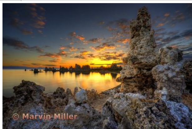
Travel Projected - 1st - Advanced

Sunrise Reveals Tufas Which Were Previously Submerged In Mono Lake Thus Showing The Damaging Effect Of Humans On The Lake Level