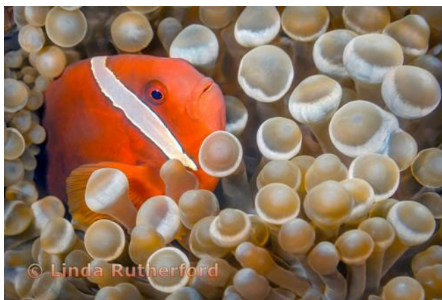
Pictorial Projected - 1st - Masters

Cinnamon Clownfish (Amphiprion melanopus) hiding in the stinging tentacles of bulb sea anemone (Entacmaea quadricolor) Taken underwater with flash while diving.