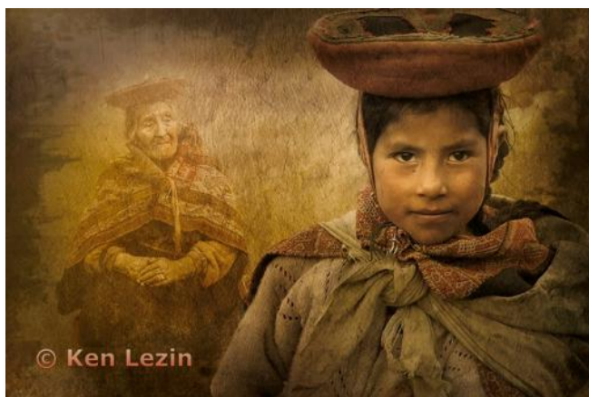
Pictorial Projected - 1st - Advanced