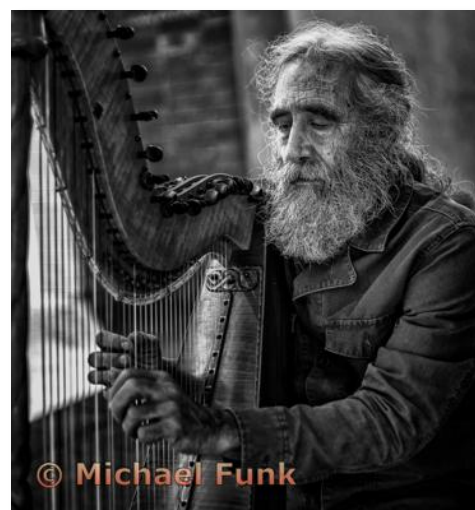
Monochrome Projected - 1st - Intermediate