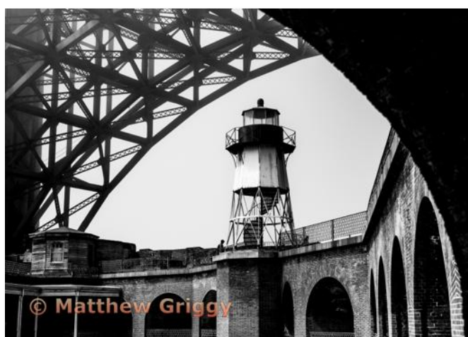
Monochrome Projected - 1st - Basic