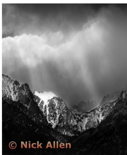
Monochrome Projected - 1st - Advanced