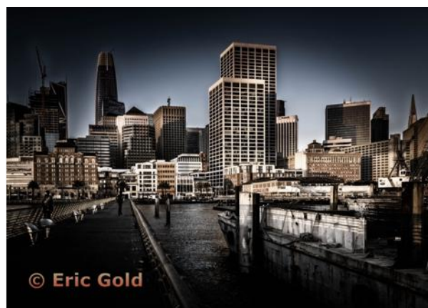
Pictorial Projected - 1st - Basic