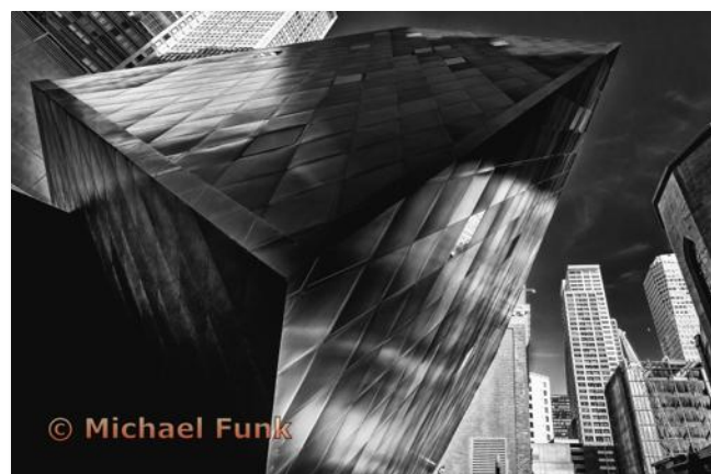
Pictorial Projected - 1st - Intermediate

My view of the Contemporary Jewish Museum in San Francisco, CA.