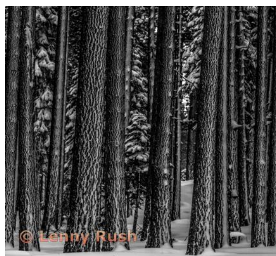
Monochrome - 1st - Masters