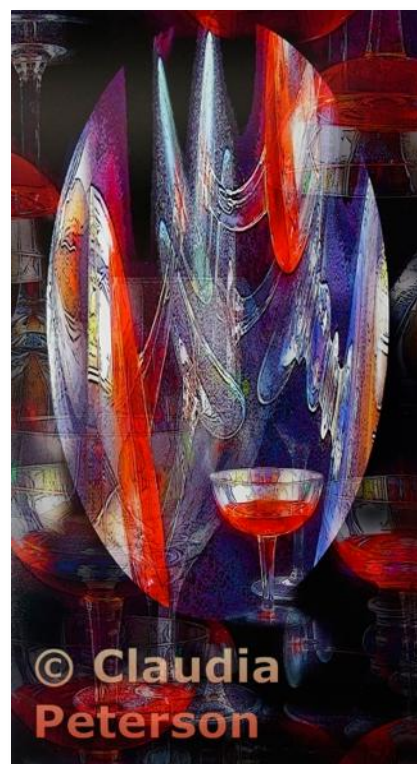
Creative Prints - 1st Place - Advanced Moods of Wine