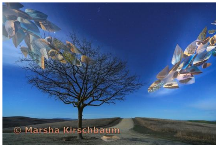
Creative Projected - 1st - Intermediate