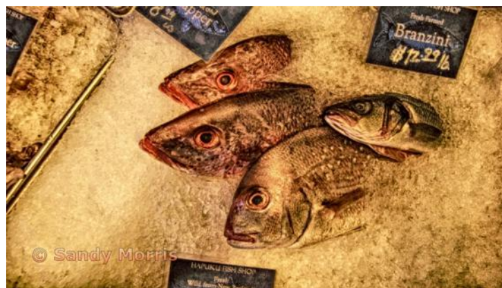
Pictorial Projected - 1st - Intermediate