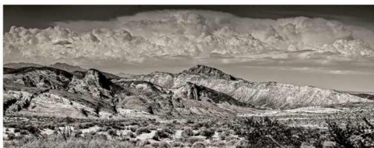
Monochrome Prints - 1st Place - Basic