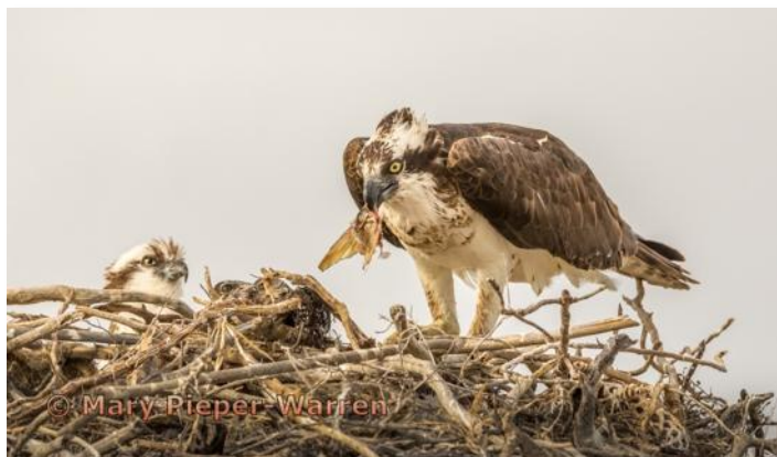
Nature Projected - 1st - Intermediate