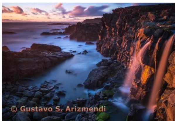
Pictorial Projected - 1st - Basic