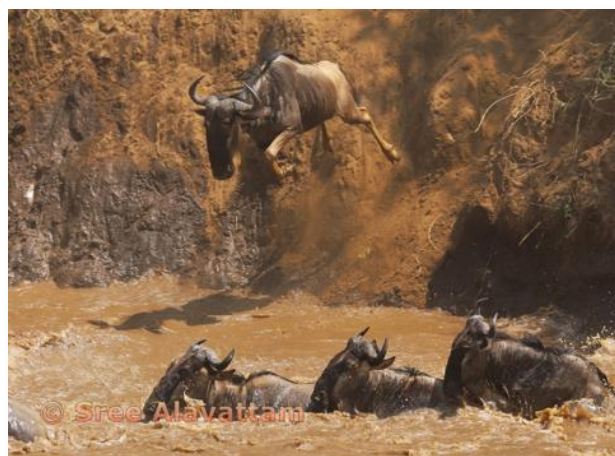
Nature - 1st - Advanced