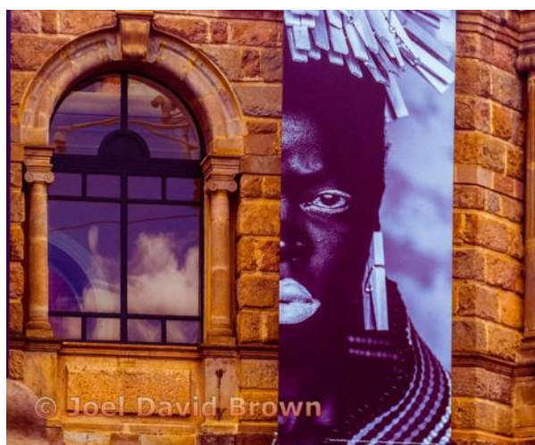
Creative Projected - 1st Basic