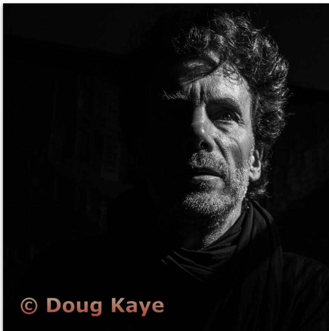
Monochrome - Prints - 1st - Advanced