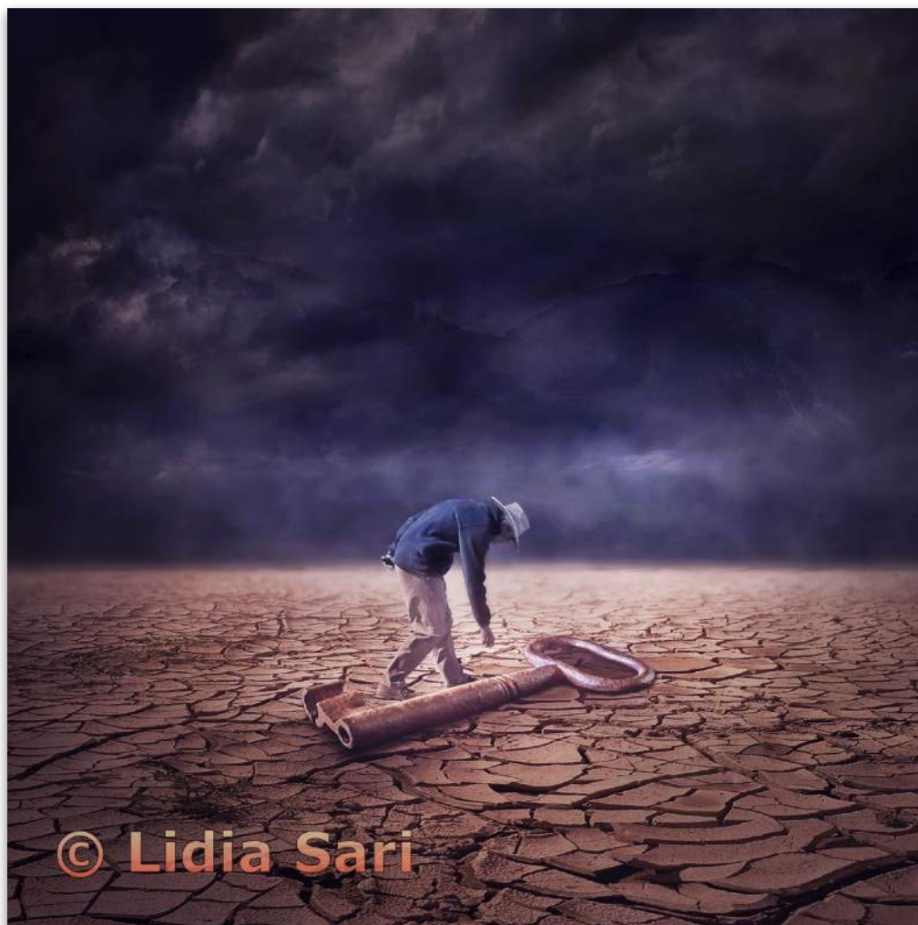
Creative - Prints - 1st - Basic

Always believe that something wonderful is about to happen.