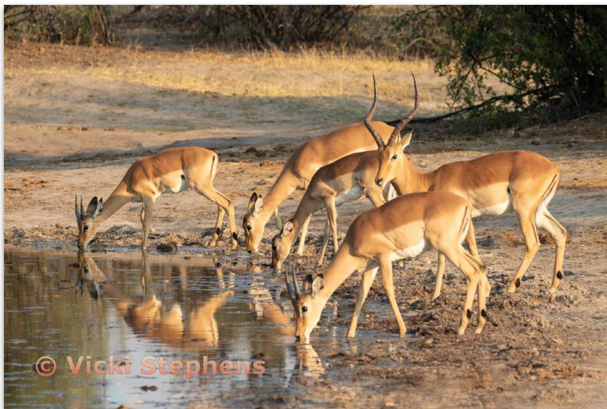
Nature - Prints - 1st - Basic

Knowing predators wait around watering holes at dusk, the impala will drink during the hottest part of the day. They have acute senses and are constantly alert to danger.