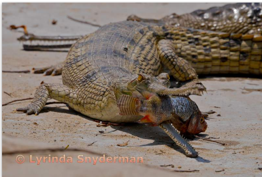
Nature Projected -1st - Intermediate

With 110 sharp teeth in its long, thin snout, the long-lived but endangered gharial is well adapted to catching fish. It is found in sandy freshwater river banks of the northern Indian subcontinent.