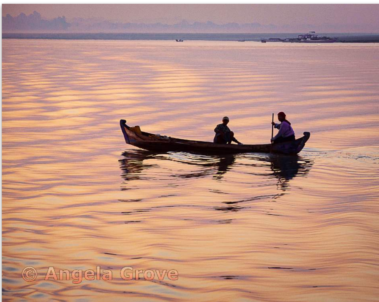
Color - Prints - 1st - Basic