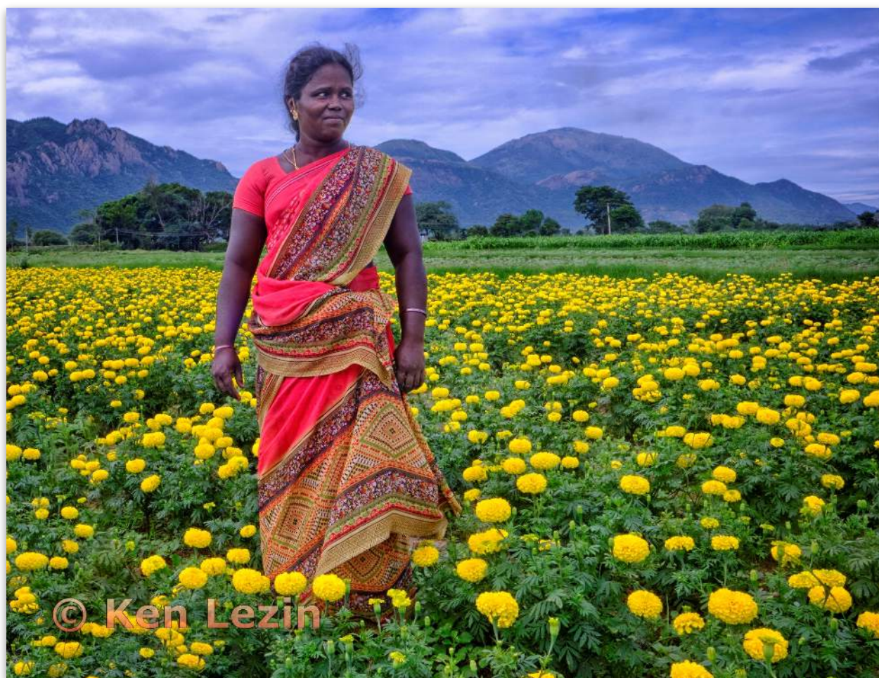
Color - Prints - 1st - Masters