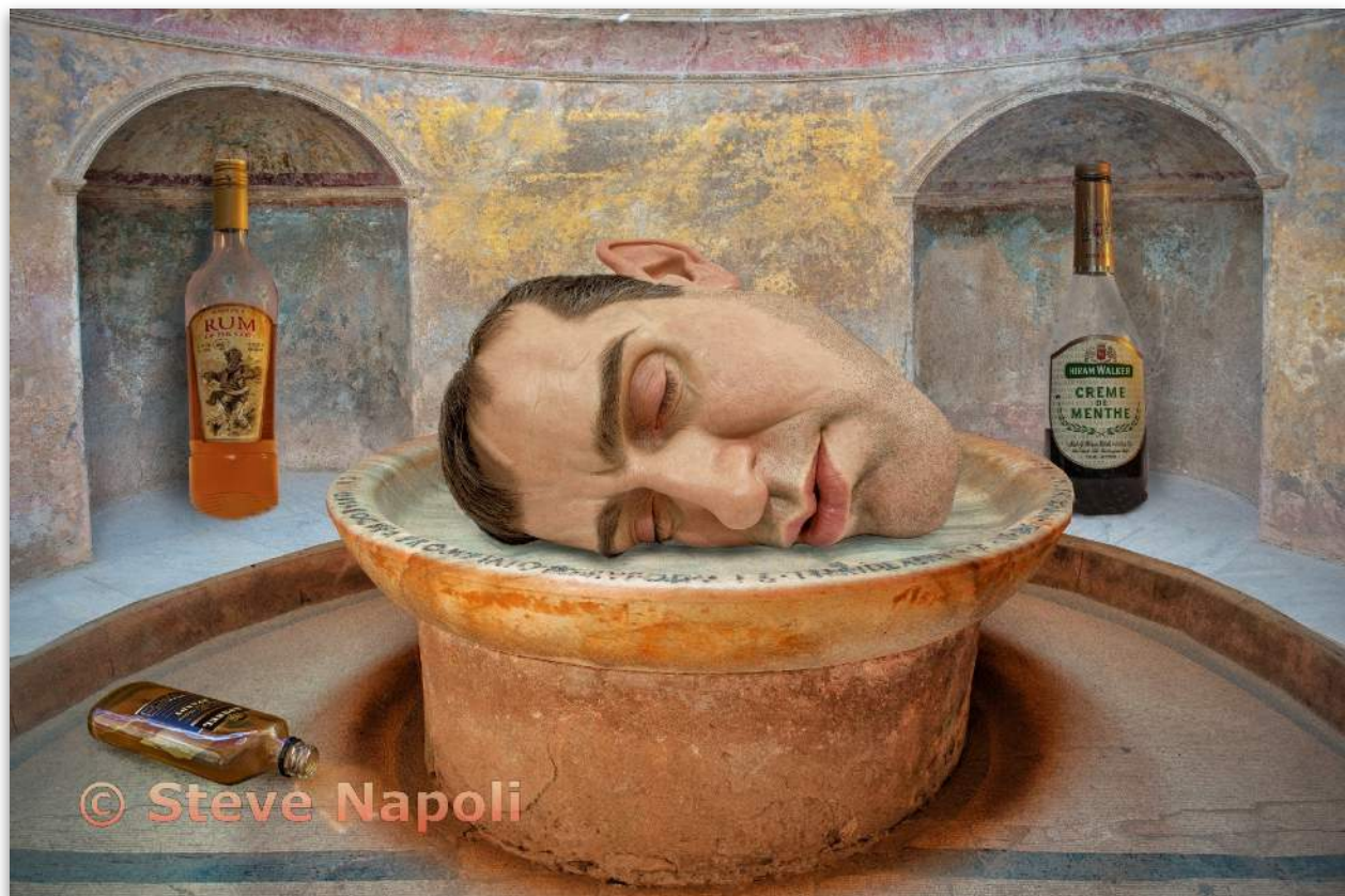
Creative Projected -1st - Masters